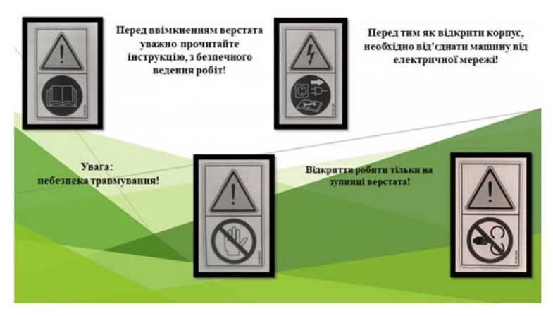
Figure 1. Safety signs in the online instructions

For example, the video instructions present the method of safe work on the equipment, safety rules in the workplace, as well as safety signs (Fig. 1). The issues covered are important: home care, fire safety rules, and the use of primary fire extinguishers.